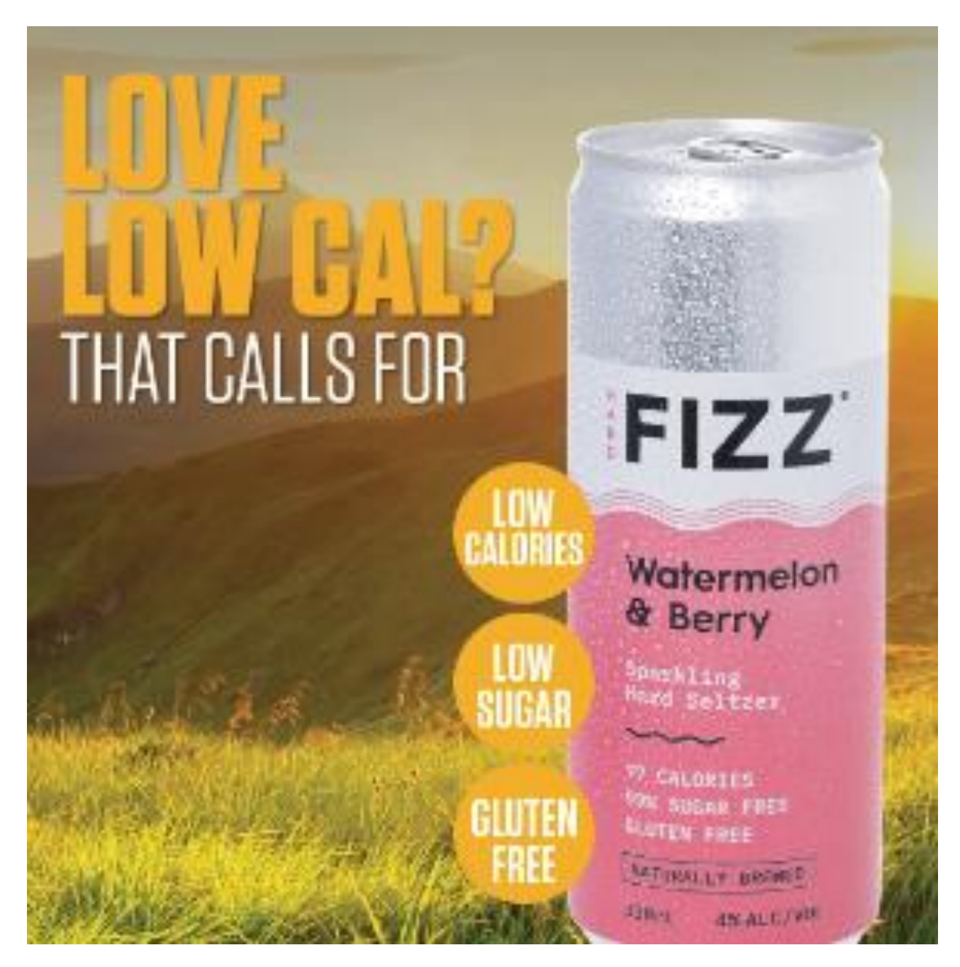
Images: Alcoholic product advertised on social media with sugar and energy content claims, gluten free claim, and claims about being 'naturally brewed'.