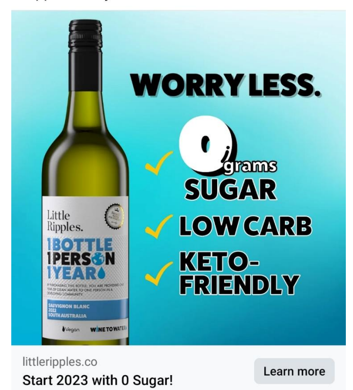
Image: Alcoholic product marketed with sugar and carbohydrate content claims, reference to 'keto' diet and 'worry less' slogan.

Learn why Aussies are switching to Little Ripples today.